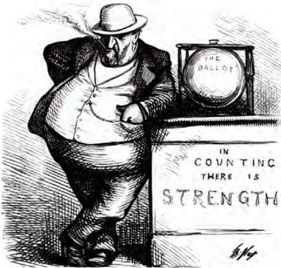
BOSS TWEED: "As long as I count the Votes, what are you going to do about it?"

Join us in contacting and meeting with local and statewide congressional members and candidates to inform and educate them on electoral reform issues.